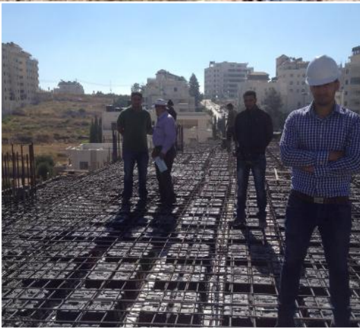
Project site: Ramallah (Palestine) Description: Tower - Intermediate floor