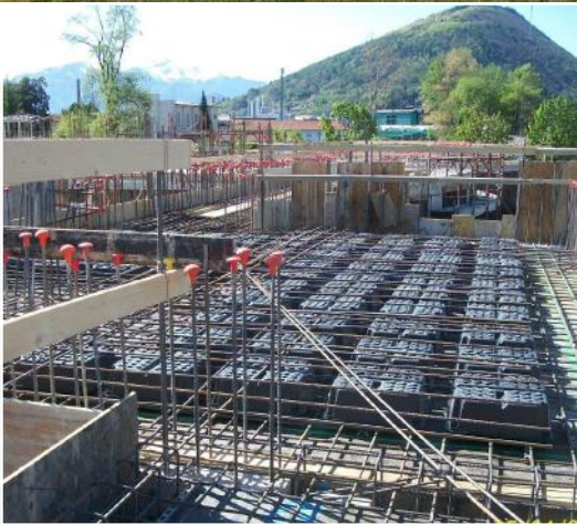
Project site: Verbania - Italy Description: "Il Maggiore" Theatre and Congress Centre - Intermediate floor