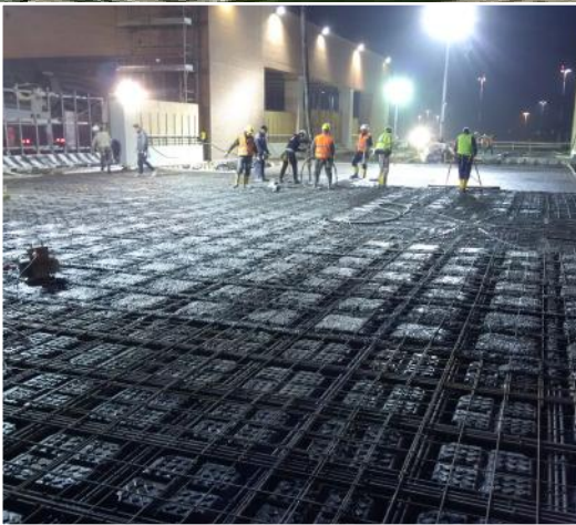
Project site: Marco Polo Venice Airport (Italy) Description: “Moving walkway e Porta d’acqua” project Raft foundation and Intermediate floor