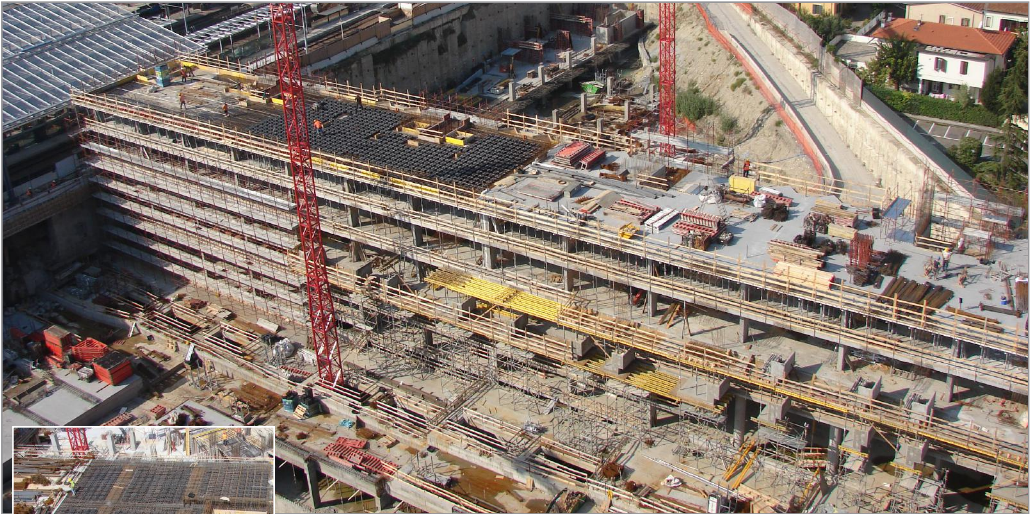
Project site: Parma (Italy) Description: Train station - Intermediate floor Architectural planner: Oriol Bohigas Architect