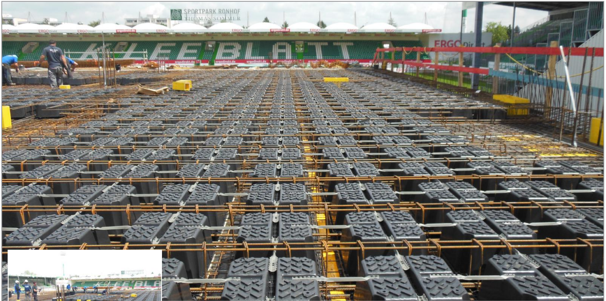
Project site: Nuremberg - Germany Description: SPORTPARK Stadium- Intermediate floor Maximum span: 10 x 9 m